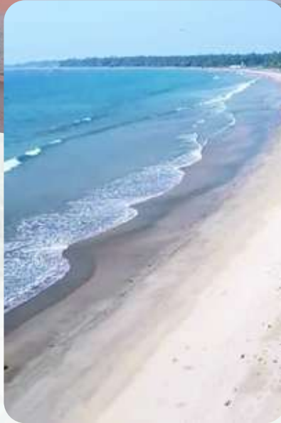
Day 2 Malvan