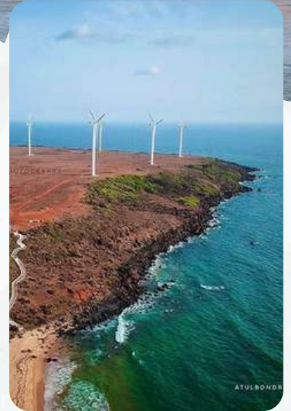
Day 3 Devgad