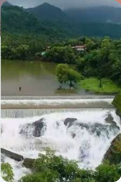
Day 1 Kankavali